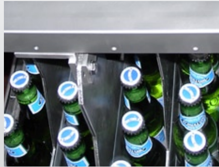
The HEUFT line-up