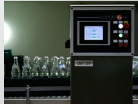
The HEUFT synchron