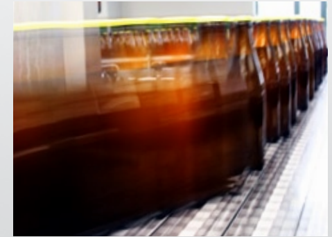
The HEUFT relax